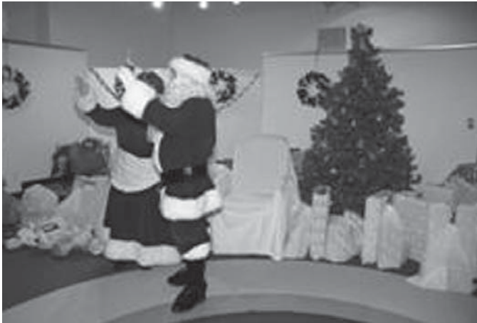
Santa and Mrs. Claus greet the children, staff and volunteers of Ranken-Jordan Pediatric Hospital during their annual holiday visit.

In a visit that has become an annual tradition, Santa Claus recently made his way to Ranken-Jordan Pediatric Specialty Hospital with some assistance from the Maryland Heights Police Officer's Association and city employees. Since the hospital's December 2004 relocation to Maryland Heights, the association has coordinated the visit and provided holiday gifts to the hospital's young patients. This year, Santa visited the hospital on the morning of December 18th.